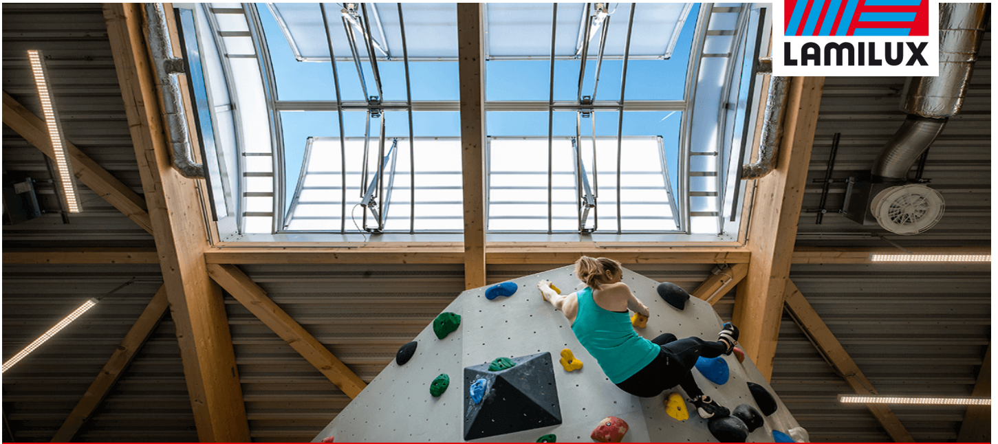
Climbing Centre OWL, Brakel